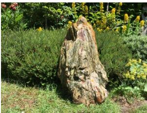
September Francois Guernon