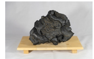
December Gail Hall