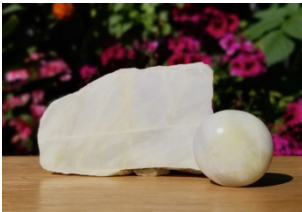
January Larynda Brown